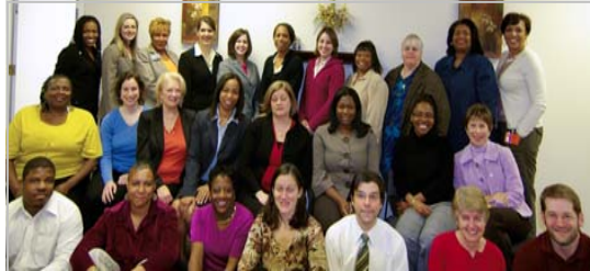
The staff of the consolidated LANC-Winston-Salem Office.

"The need to continue to provide life-altering solutions to critical legal issues is crucial to ensuring that all people in our community can survive, grow and prosper. The Winston-Salem community has supported Legal Aid and its clients for more than 45 years, and now we can move forward in an even more united manner to help people in our area."